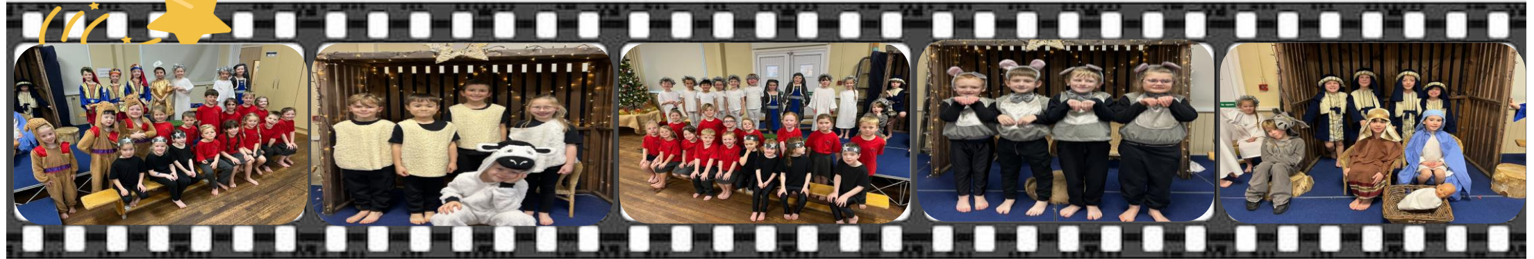
Year One Nativity